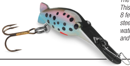
The No. 50 is a high-action Hot Shot. This small, but deadly plug dives up to 8 feet and is particularly effective for steelhead and salmon in low and clear water conditions. The No. 50 is also an exceptional lure for large trout.

The faster your rod tip pulses, the deeper the plug is diving. Hold your boat back against the current enough to force the Hot Shot to dive and then thoroughly work through each stretch of fishy water before moving on downstream.