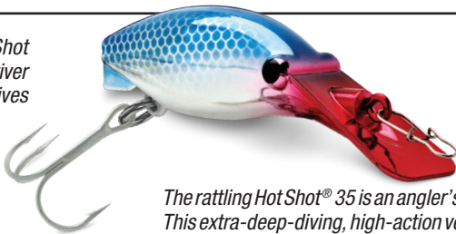
The rattling Hot Shot® 35 is an angler's dream. This extra-deep-diving, high-action version of the popular #30 is deadly for all game fish.